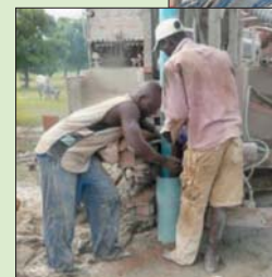
Drilling at Tabou Village in Burkina Faso with partners DAPLS