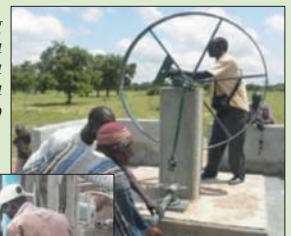
Demonstrating the new Volanta Pump at Tabou Village, Burkina Faso