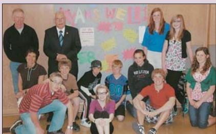
Showing their support! Youth Group members from the Knox Presbyterian Church, Red Deer