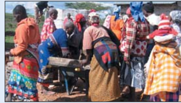
Traditionally nomadic Maasai women of Kajiada, Kenya are trained in the building of household rainwater harvesting tanks as their culture adapts in a changing world.

The earth has a limited amount of water in its many different forms – snow, ice, vapour, salt water, groundwater, freshwater, etc. It is the water cycle that continuously circulates the earth's water resources through different phases and governs what water supply is available for our use. Solar energy powers the water