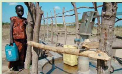
Clean water access point in Uganda, 2009