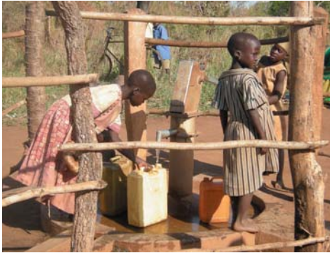
Girl students of Omiri Primary School collect clean drinking water from their new well.

Like you, we're keen to hear how our projects are progressing after they have started and once they're completed. On a recent monitoring trip to Uganda, we visited our local partners and the many water and sanitation projects that have been completed over the last year. We rely on communications from our project partners in the communities to keep us not only updated, but inspired, too. We received the lovely letter below from the community at Omiri Primary School in Oyam District of Northern Uganda during our visit: